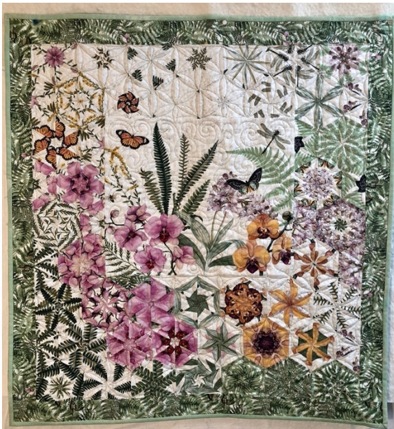
Left: Julie Curry –Orchid Fern hexified panel